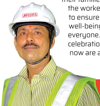
SAMRUDDHI MAHAMARG PKG - 14

their families, and the workers to ensure well-being of everyone. The celebrations now are an