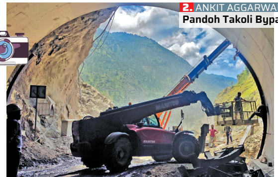
2. ANKIT AGGARWAL Pandoh Takoli Bypass