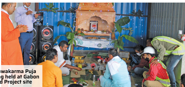
Vishwakarma Puja being held at Gabon Road Project site

Like every year, Afconians celebrated Vishwakarma Puja at Afcons House and sites on September 17. The day was marked with prayers to seek blessings from the Divine Architect on his birthday.