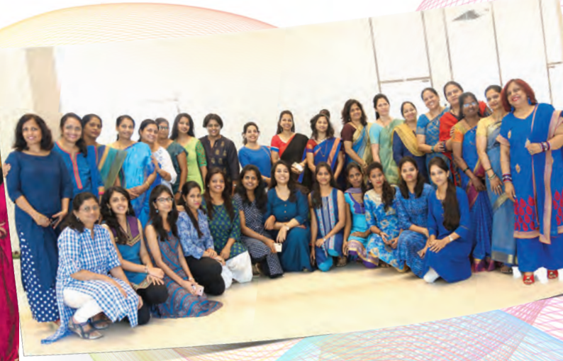
Colour Day is an integral part of Dussehra celebrations at Afcons