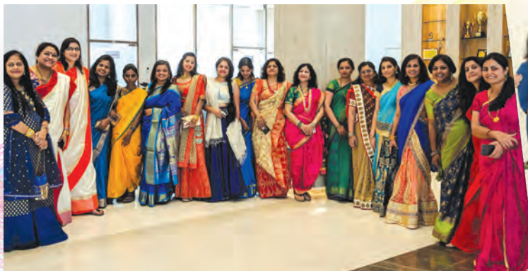
Afconians dressed in festive colours on Navratri