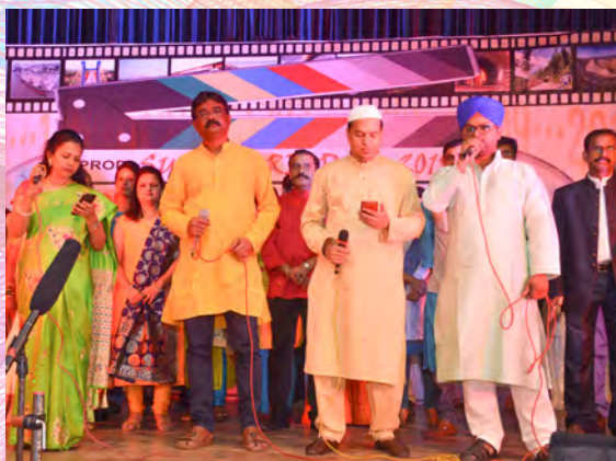
A talented bunch of Afconians enthrall the audience during the annual Dussehra event