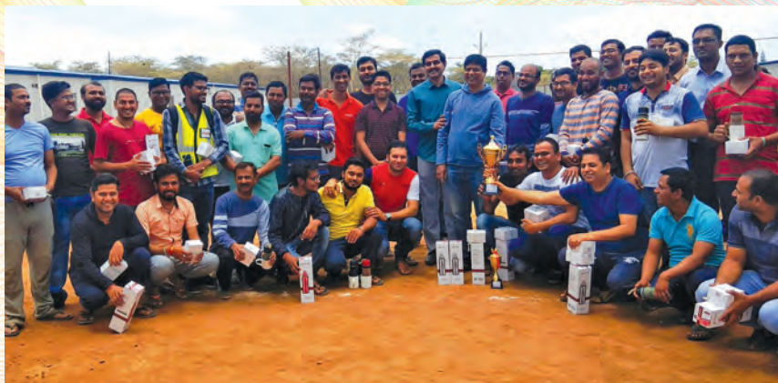
Sports tournaments were held at Lusaka site as part of Dussehra celebrations