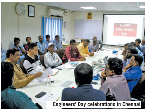
Engineers' Day celebrations in Chennai