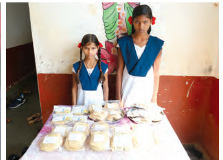
Ashramshala children set up a stall of snacks they made as part of the Afcons-supported IBT programme