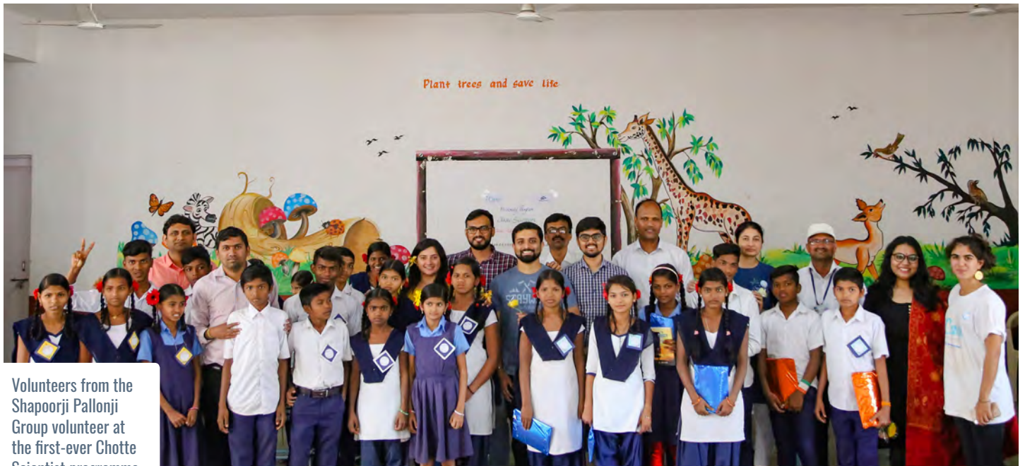
Volunteers from the Shapoorji Pallonji Group volunteer at the first-ever Chotte Scientist programme