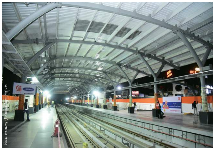
More stations will require more ticket counters and ticket vending machines.