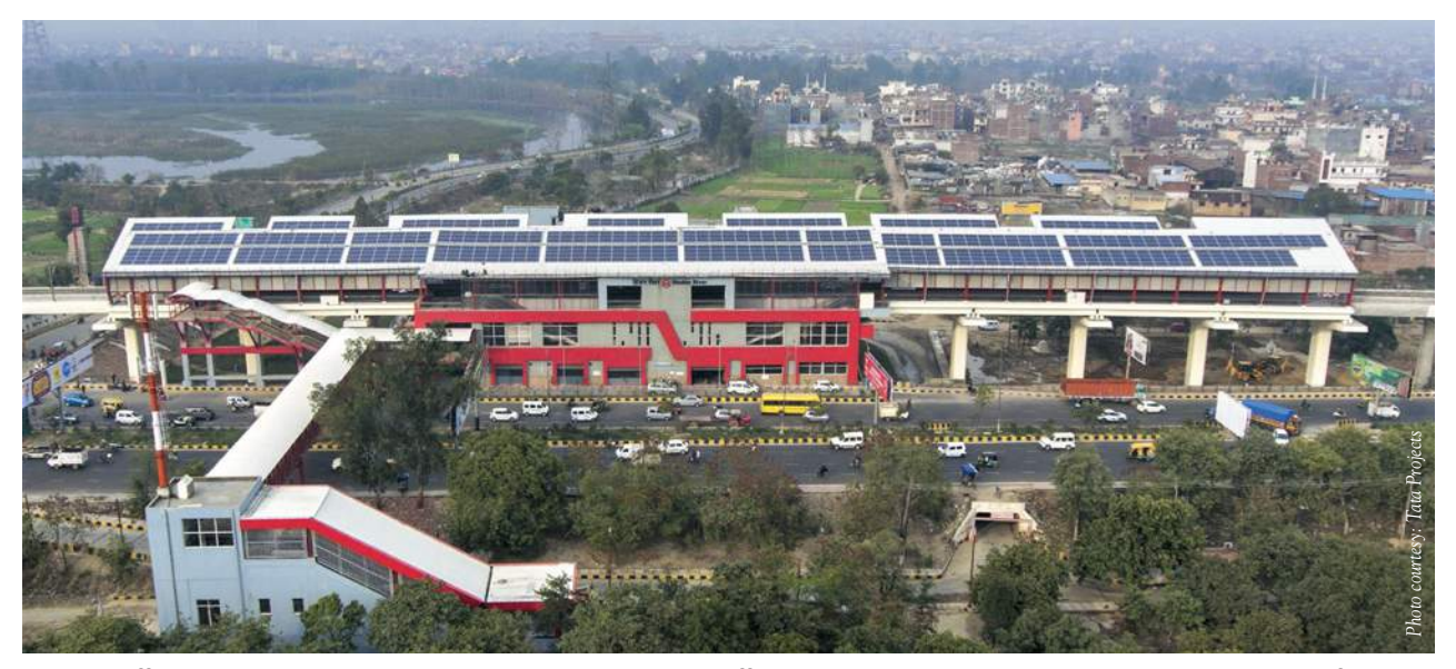
Energy-efficient technologies such as solar panels on-site/off-site installations make metro systems more eco-friendly.

Nagpur Metro has a total of 38 stations, and is divided into North-South and East-West