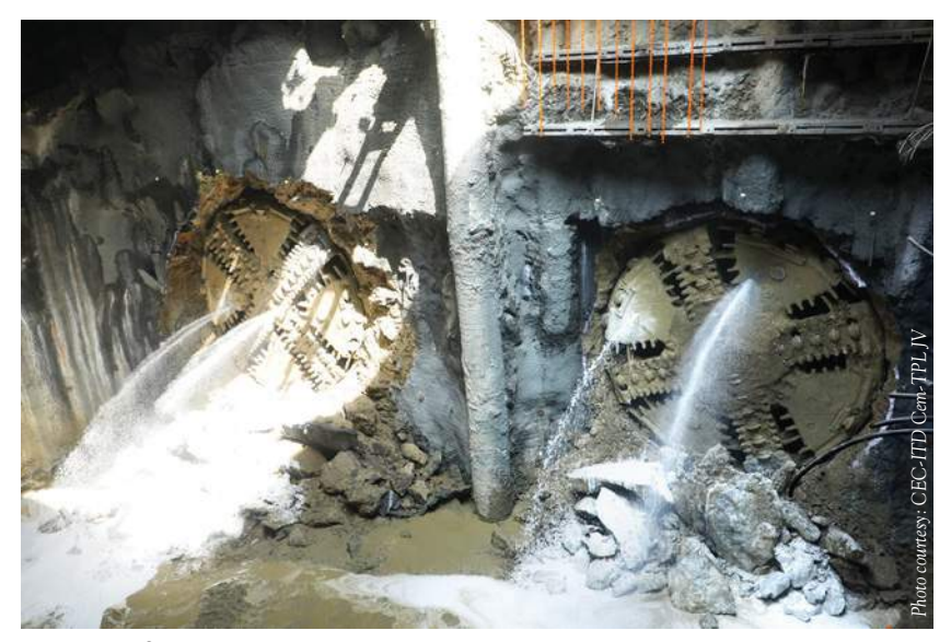
The cost of a metro project depends on the geographical location as well as many development constraints and requirements.