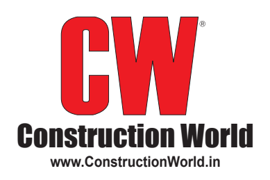
Follow me on twitter @PratapPadode