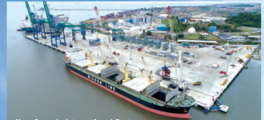
New Owendo International Port

The rate of progress during several activities is exemplary. Afcons achieved a 2.5-day time cycle for pre-cast launching, which accelerated the pace of the project. As with all of its projects, impeccable safety standards were maintained and 6.5 million man hours were achieved without any LTI.