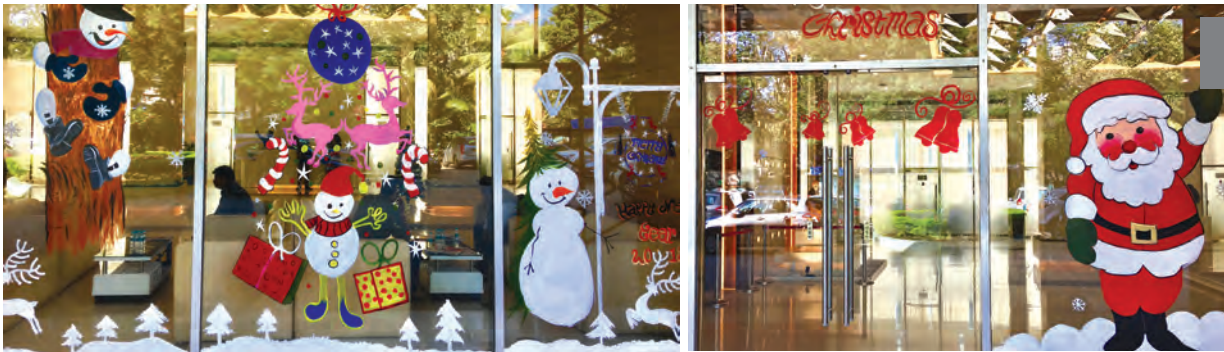
Christmas decorations at Afcons House