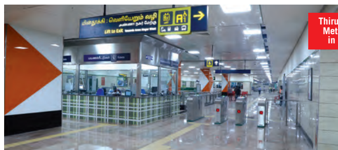
Thirumangalam Metro station in Chennai

Implementing on behalf of CMRL, Afcons has become the first infrastructure company to achieve platinum rating by the Indian Green Building Council (IGBC) for underground Metro stations in Chennai. It is the highest recognition by an international accreditation body for green building. The Chennai Metro project was initiated by the Government of Tamil Nadu to meet the ever-growing commuting needs while also reducing the pollution levels ■