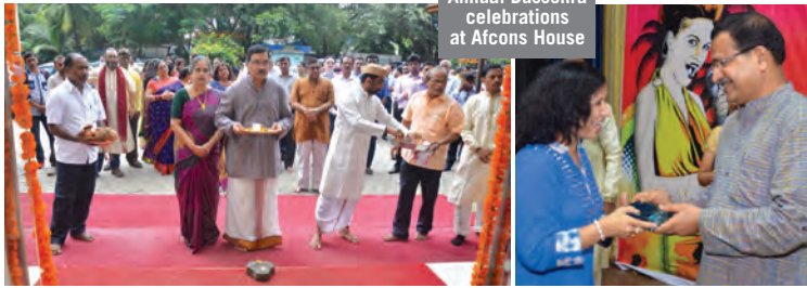
Annual Dussehra celebrations at Afcons House