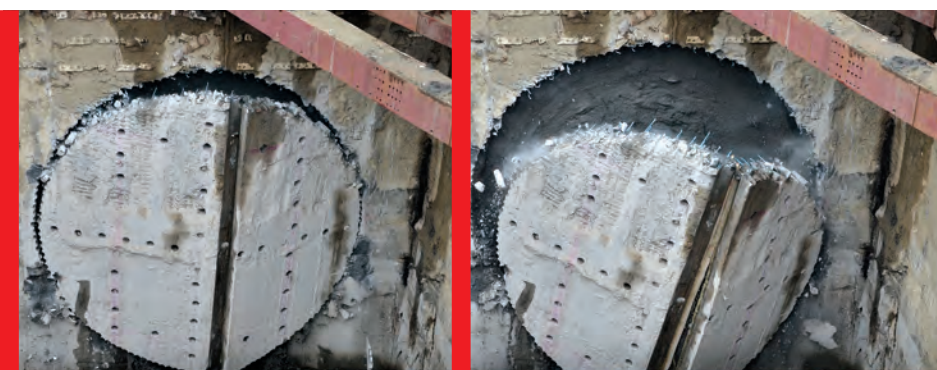
Prayers and ecstasy marked the breakthrough moment at CMRL site

time after being abandoned by another contractor.