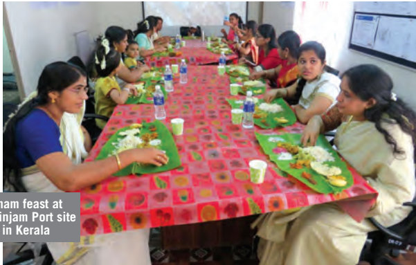
Onam feast at Vizhinjam Port site in Kerala