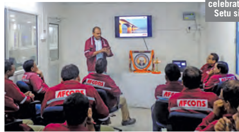
Engineers' Day celebrations at MG Setu site, Patna