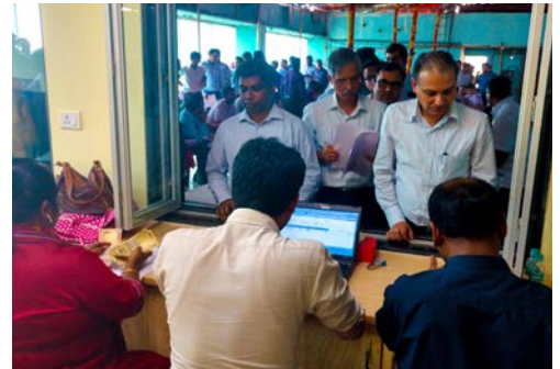
The finance department organised this initiative with support from the salary department

AFCONS came forward to support the employees after the Central Government's move on November 8, 2016, to withdraw from circulation all old notes of Rs500 and Rs1,000. As part of this initiative, the finance department, with support from the salary department, arranged with ICICI Bank to help exchange old notes with new ones at the HO on November 17 and 18, 2016. The employees were asked to fill up a declaration form and present a valid identity proof. Each person was allowed to exchange as per RBI guidelines. Around 250 employees of HO and Oil & Gas BU benefitted from this move.