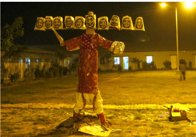
Ramleela celebrations at the Agra-Lucknow Expressway project site