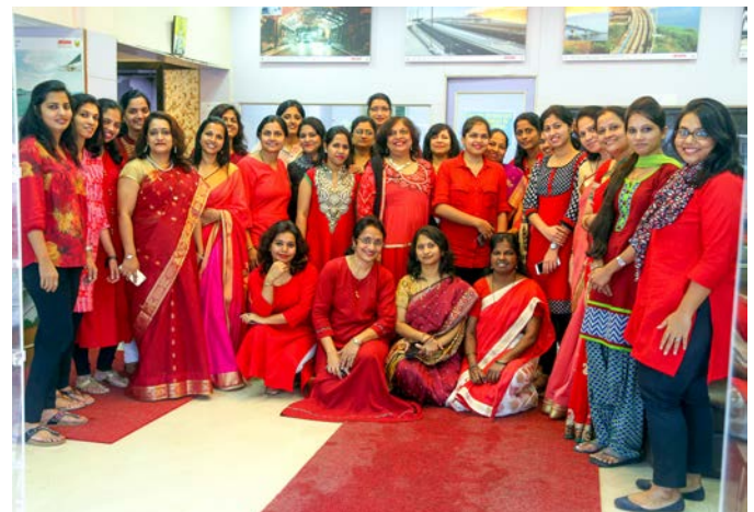
Colours Day celebrations at AFCONS HO

programme was attended by the employees from the Head Office and Oil & Gas BU. It was aimed at sharpening the MS Excel skills of the participants by providing deep insights on various tools of Excel including conditional formatting, data validation and VLOOKUP, Mail Merge among others.