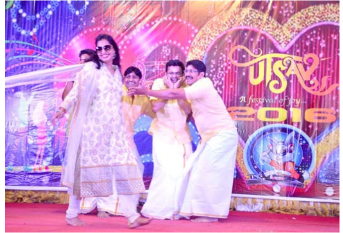
Utsav 2016, the cultural event during Navratri at the HO, received an overwhelming response