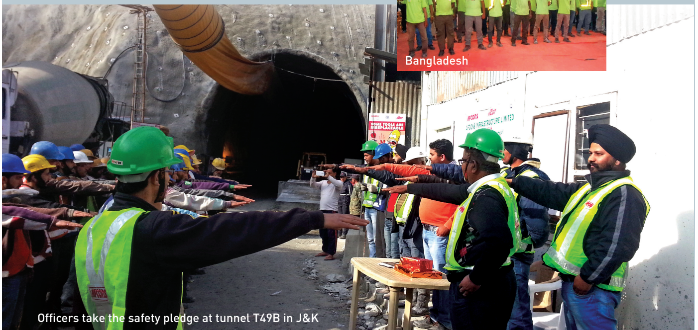
Officers take the safety pledge at tunnel T49B in J&K