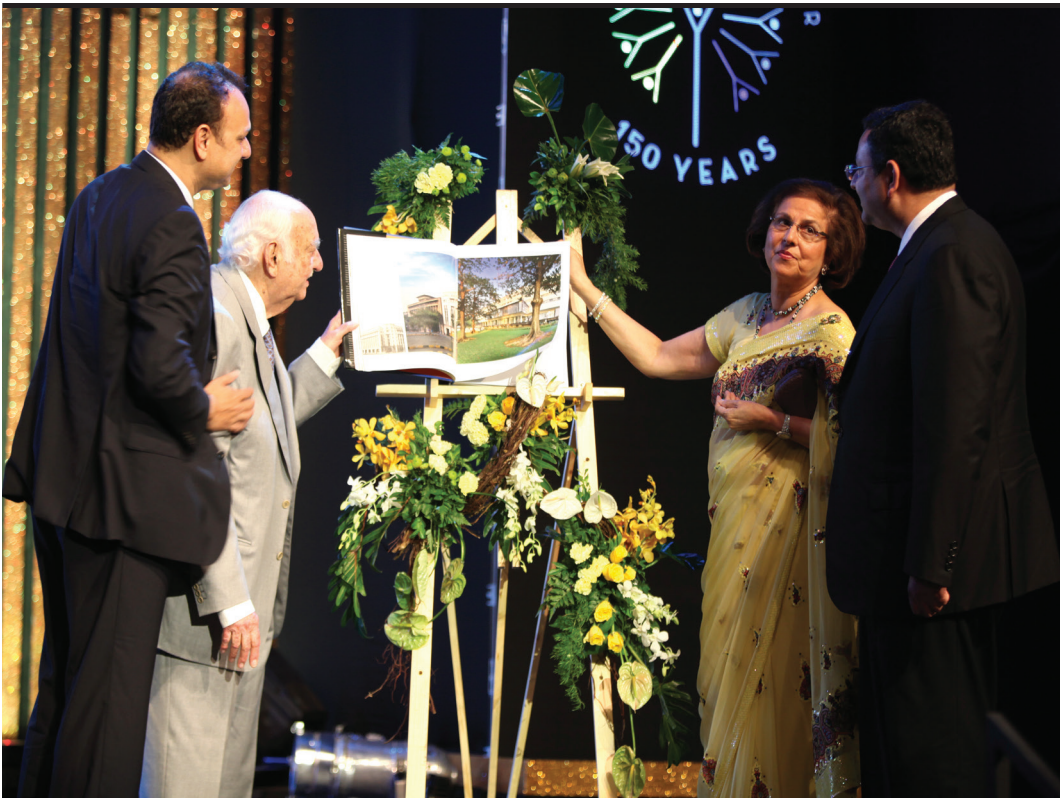
STRONGER TOGETHER: Pallonji Mistry and wife Patsy Mistry with sons, Shapoor and Cyrus Mistry, at the SP Group's 150 years' celebration ceremony, in Mumbai, last year