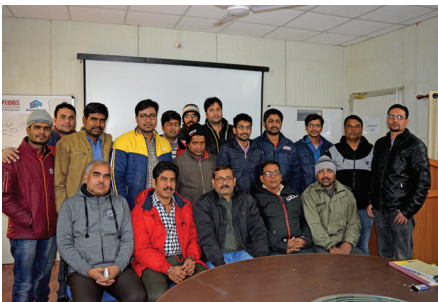
Costing & Budgeting training at T49B & T74R