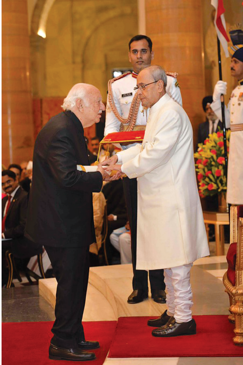
Shapoorji Pallonji Group (SP) Chairman Emeritus, Mr Pallonji Shapoorji Mistry, receives the Padma Bhushan from President of India, Shri Pranab Mukherjee, at Rashtrapati Bhawan, in New Delhi, on March 28, 2016