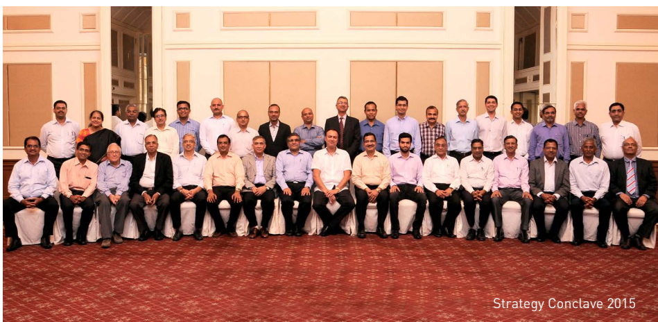
Strategy Conclave 2015