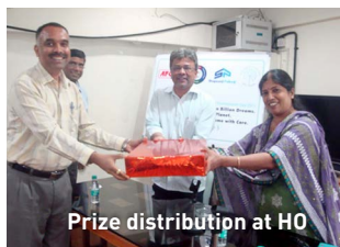
Prize distribution at HO