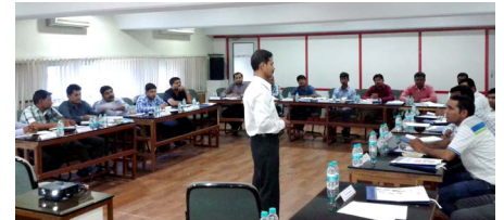
Junior Management Development Programme at HO

The programme was organised at head office in two phases. The programme was attended by senior engineers & engineers from different sites. Phase I: April 06 to 09, 2015 – 23 Participants Phase II: June 15 to 18, 2015 – 20 Participants