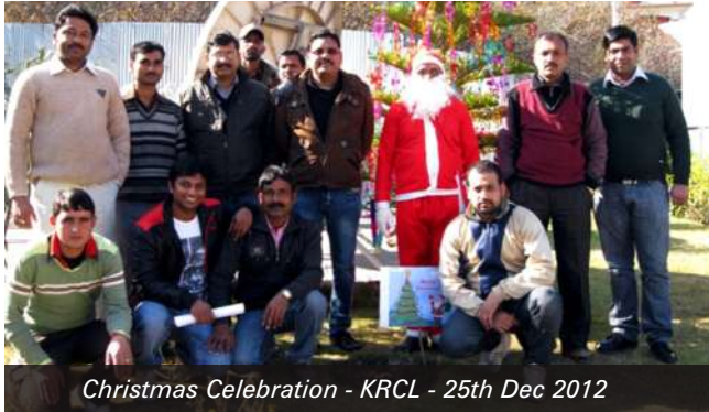
Christmas Celebration - KRCL - 25th Dec 2012

Christmas party was organised at various sites like Chenab, KRCL, CMRL & Liberia on 25th December 2012.