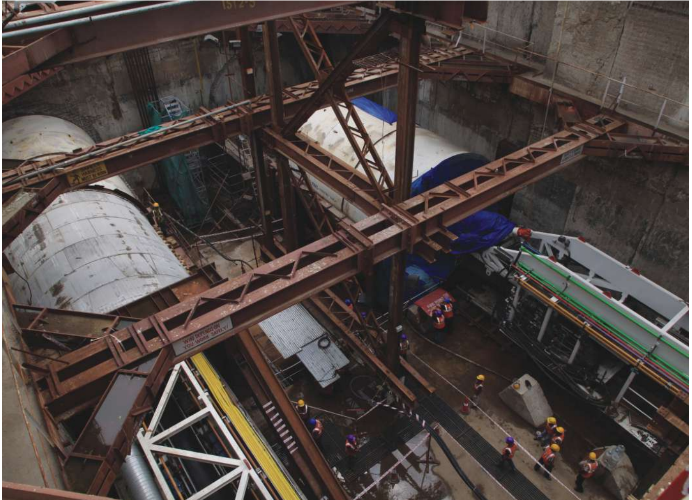
Tunnel Boring Machine (TBM) launch at Chennai Metro Rail Site on 28th December 2012