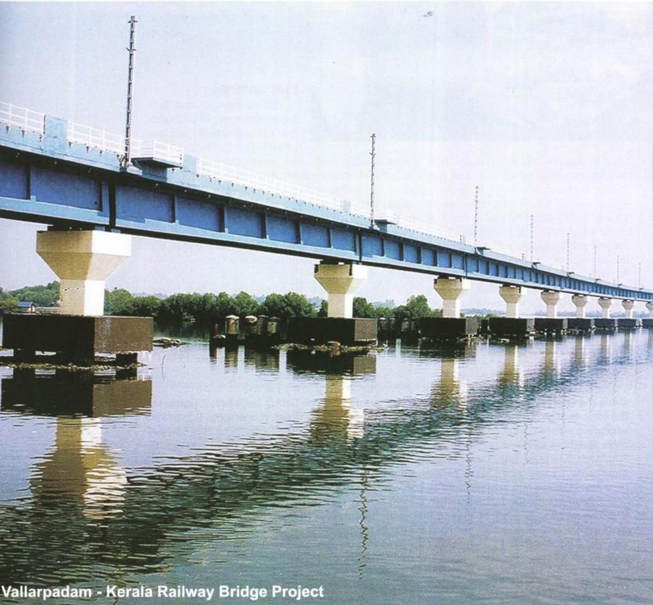
Vallarpadam - Kerala Railway Bridge Project

An ISO 9001-2008, ISO 14001-2004 & OHSAS 18001-2007 Company